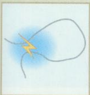
Explaining copy-number changes in cancer, p 1096