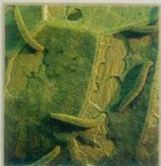
Modified Bt toxins counter insect resistance, p 1128