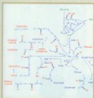
Grading biosynthetic pathways, p 1074