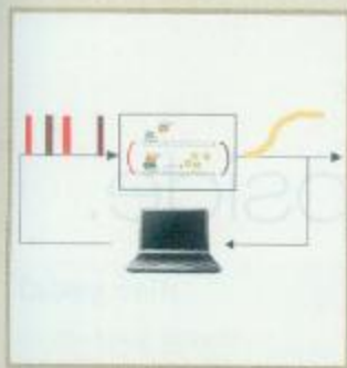
Computer-controlled cells, p 1114