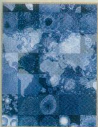
Images of some of the 125 human embryonic stem cell lines in laboratories around the world studied by the International Stem Cell Initiative (p 1132).