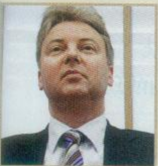
Human stem cell patents banned in Europe, p 1057