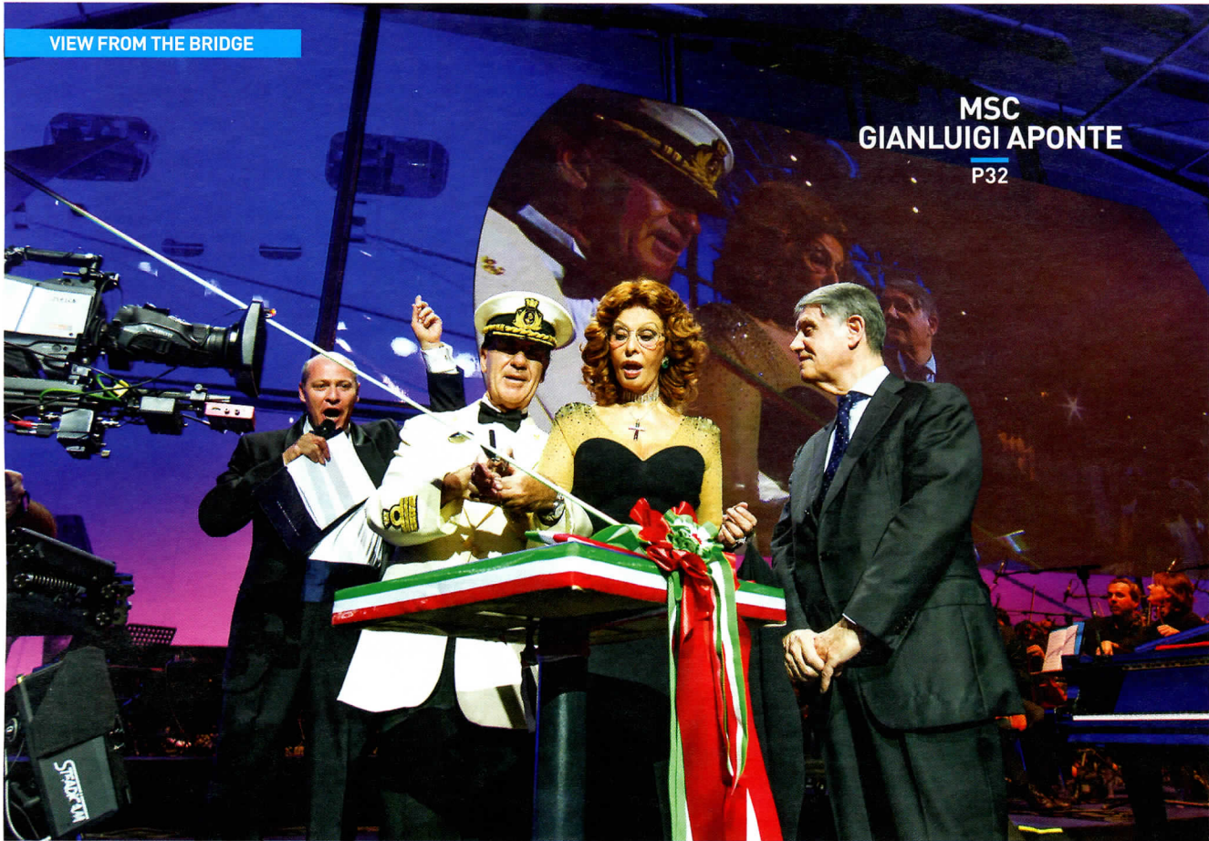
VIEW FROM THE BRIDGE