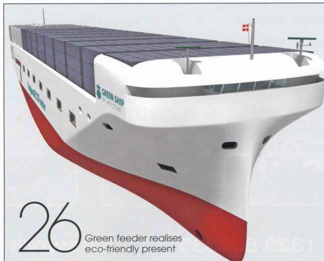
26 Green feeder realises eco-friendly present