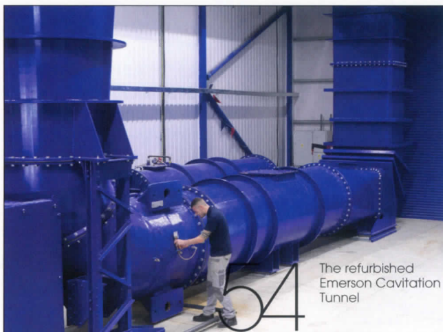
The refurbished Emerson Cavitation Tunnel

Visit http://www.rina.org.uk/Naval-architect-digital.html to read the digital editions, or download the free RINA Publications App.