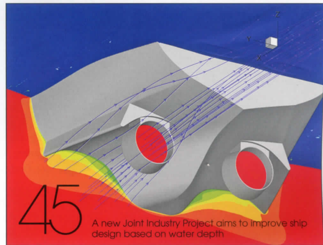
A new Joint Industry Project aims to improve ship design based on water depth