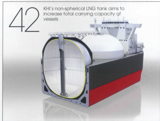
KHI's non-spherical LNG tank aims to increase total carrying capacity of vessels