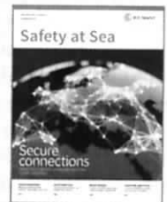
iStock/Getty Images 5077416

The Sea Traffic Management project seeks to improve information exchange between ship and shore for safer navigation. P24